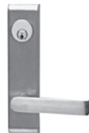
● TRIM PARA BARRA DE PANICO MOD.912LDAN