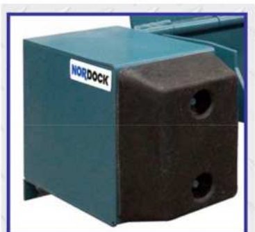
CLOSED BUMPER BLOCKS