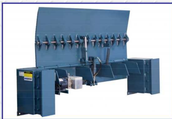
MODEL EFH 60,000 POUND CAPACITY SHOWN WITH OPTIONAL STEEL FACE VERTICAL DOCK BUMPERS