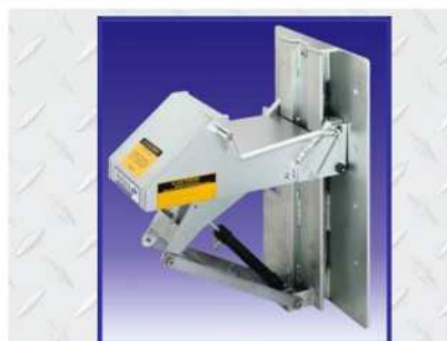
AVAILABLE TRUCK-LOCK® SAFETY SYSTEMS