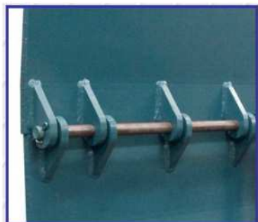
SELF-CLEANING LIP LUG DESIGN