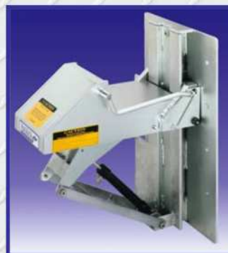
Available TRUCK-LOCK® Safety Systems