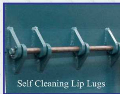
Self Cleaning Lip Lugs