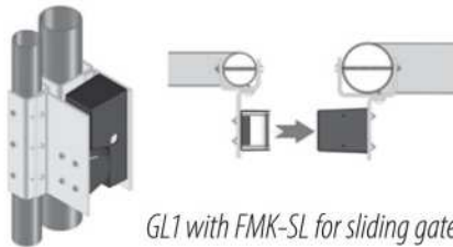
GL1 with FMK-SL for sliding gates

The FMK Flex-Mount Bracket System is an intuitive set of mounting brackets designed exclusively for use with the the M62FG Magnalock® and GL1 Gate Lock. Pre-formed post channels and plates of varying lengths make it easy for you to assemble a professional looking, high-security gate lock mounting platform in minutes, without special tools.