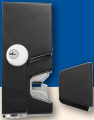
GL1 Electromechanical Gate Lock