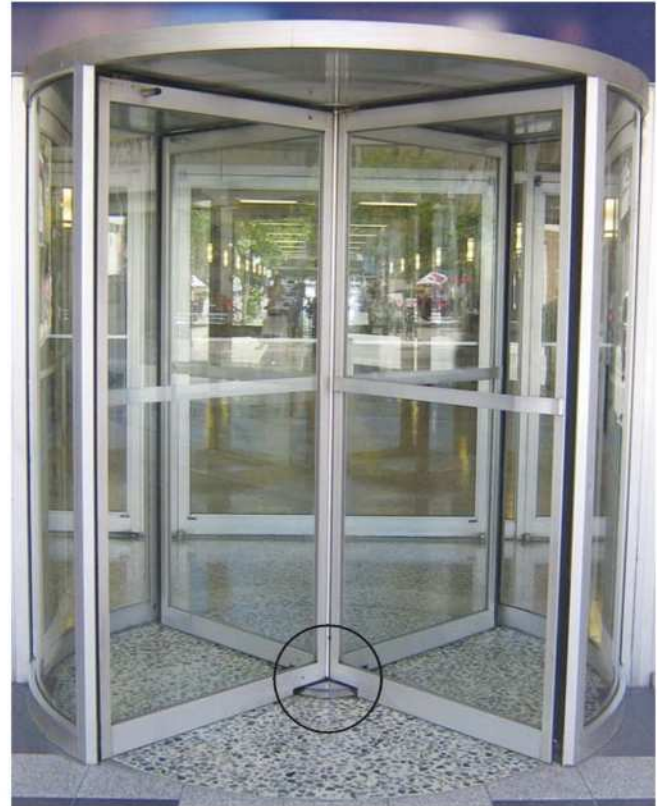
Stanley Access Technologies Series 500 Revolving Door