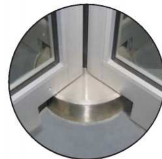
Close-Up of Collapsing Mechanism